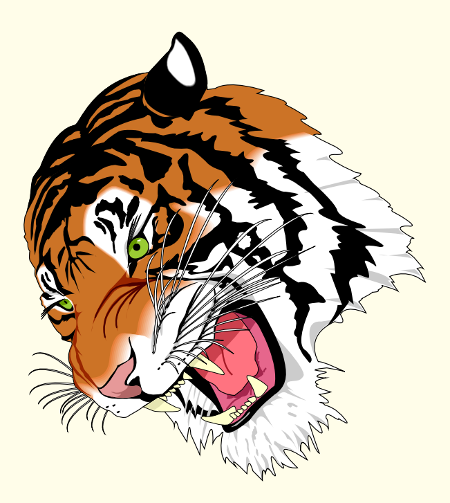
Fig. 1. More details on the usage of \includegraphics can be found in the grfguide.ps of the \begin{tabular}{l} \end{tabular} TEX documentation.