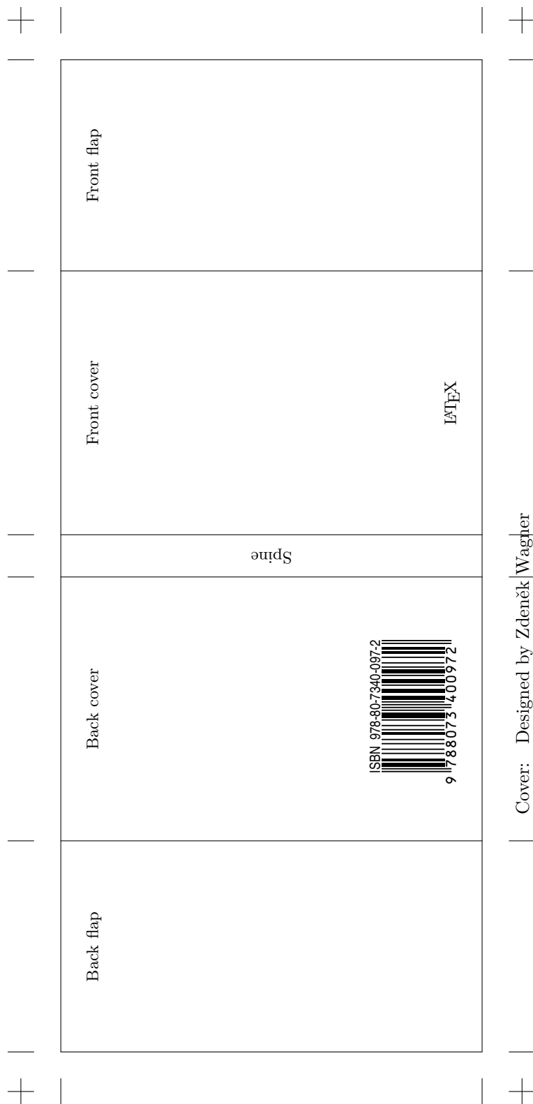
Figure 2: Sample of a book cover with flaps