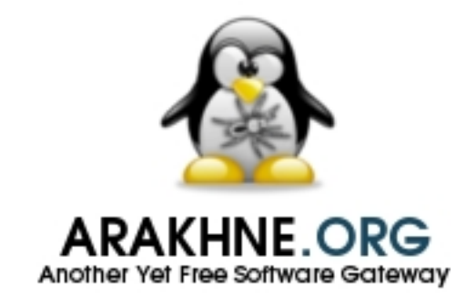
Figure 5.1: Example of figure inclusion with \mfigure

The figure 5.1 page 30 is obtained with the macro: \mfigure[ht]{width=.4\linewidth}{slogo}{Example of figure inclusion with \texttt{{\textbackslash}mfigure}}{example:mfigure}. The reference and page reference are obtained with \figref{example:mfigure} and \figpageref{example:mfigure}.