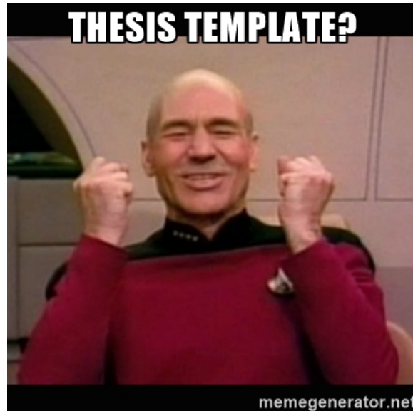
Figure 1.1: Glad to have a thesis class