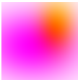
xcolor rgb model: