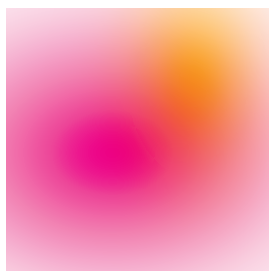
xcolor cmyk model: