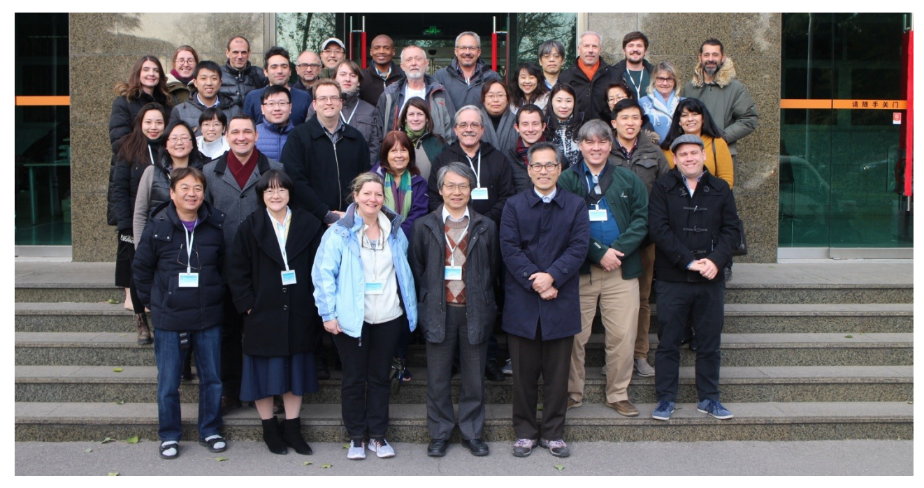
Figure 2: Example of a full-width figure showing the JACoW Team at their annual meeting in November 2017. This figure has a multi-line caption that has to be justified rather than centred.

The names of authors, their organizations/affiliations and postal addresses should be grouped by affiliation and listed in 12 pt upper- and lowercase letters. The name of the submitting or primary author should be first, followed by the coauthors, alphabetically by affiliation. Where authors have multiple affiliations, the secondary affiliation may be indicated with a superscript, as shown in the author listing of this paper. See ANNEX A for further examples.