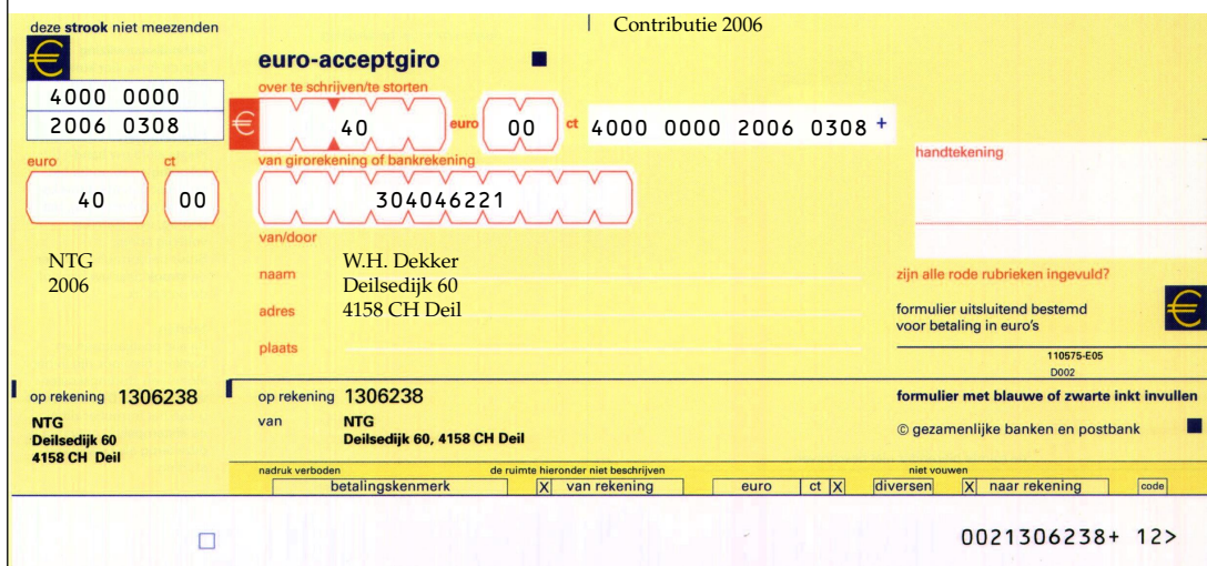
Figure 5: Invoice example with accept form

betalingstermijn: 30 dagen dagen IBAN: nl53ingb0001306238 ten name van: NTG kenmerk: 308