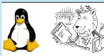
Figure 1: a figure

\let\H\hsize \ctable[ caption = a figure, figure, botcap, width=.4\H, ]{@{}>{\H=.4\H}X>{\H=.6\H}X@{}~}{\FL \includegraphics[width=\H]{penguin}& \includegraphics[width=\H]{lion}\LL } }