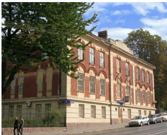
Figure 2. This is a sample of a bitmap image. This cosy building homes the Institute for Condensed Matter Physics and the CMP Editorial Office too.

Roughly speaking, there are two types of electronic figures: vector graphics and bitmap graphics. A vector image is a set of arranged objects: lines, polygons, ellipses, shades, characters, etc. Such an image allows almost arbitrary scaling without loss of quality. Vector images are typically charts, plots, diagrams, etc., produced by various computer software. A bitmap image is a two-dimensional array of pixels (PICture'S ELeMents) or “dots”. Continuous tone photographs are their the most widespread samples (like figure 2). Image quality is determined by DPI (Dot Per Inch — a pretty self-explained definition). Below, there are necessary requirements for each type of images.