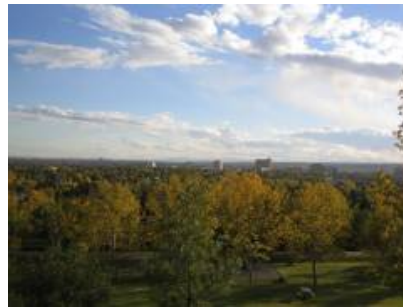
(b) Pan ma signo.