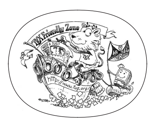
An Homage to The Elements of Typographic Style October 2017 – version 4.4