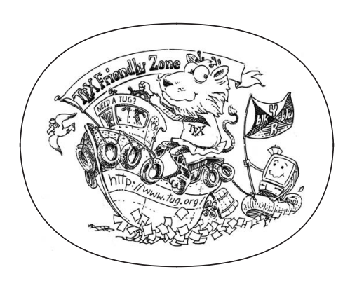
An Homage to The Elements of Typographic Style September 2015 – version 4.2