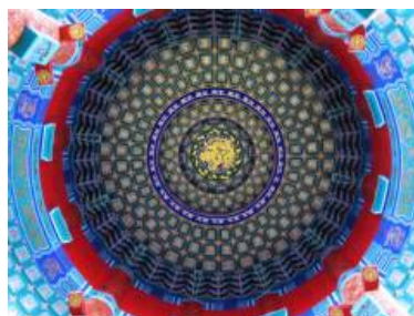
(d) Titulo debitas.