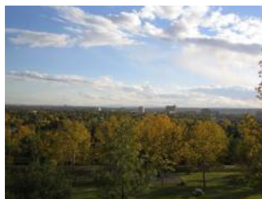
(b) Pan ma signo.