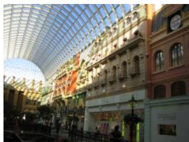
(a) Asia personas duo.