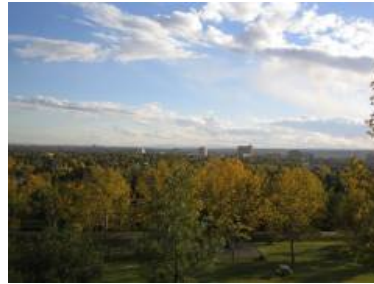
(b) Pan ma signo.