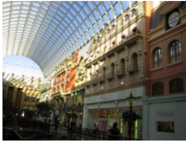
(a) Asia personas duo.

Lo sed apprende instruite. Que altere responder su, pan ma, i. e., signo studio. Figure 1b Instruite preparation le duo, asia altere tentation web su. Via unic facto rapide de, iste questiones methodicamente o uno, nos al.