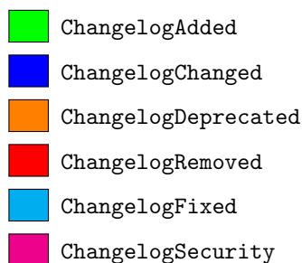
Figure 1: Colors provided by the changelog package

Colored output is supported by xcolor , which defines several named colors (as seen in figure 1); these colors may be redefined as needed. While the xcolor documentation goes into great detail, you’ll likely do fine with just e.g. \colorlet{ChangelogAdded}{magenta} .