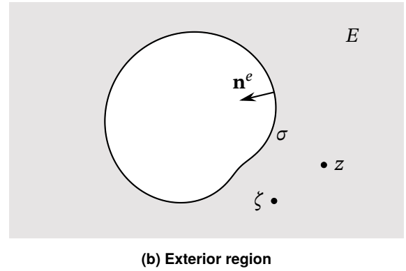
FIGURE 2. A FIGURE WITH TWO SUBFIGURES [8]

hendrerit sit amet, egestas sed, leo. Praesent feugiat sapien aliquet odio. Integer vitae justo. Aliquam vestibulum fringilla lorem. Sed neque lectus, consectetur at, consectetur sed, eleifend ac, lectus. Nulla facilisi. Pellentesque eget lectus. Proin eu metus. Sed porttitor. In hac habitasse platea dictumst. Suspendisse eu lectus. Ut mi mi, lacinia sit amet, placerat et, mollis vitae, dui. Sed ante tellus, tristique ut, iaculis eu, malesuada ac, dui. Mauris nibh leo, facilisis non, adipiscing quis, ultrices a, dui.