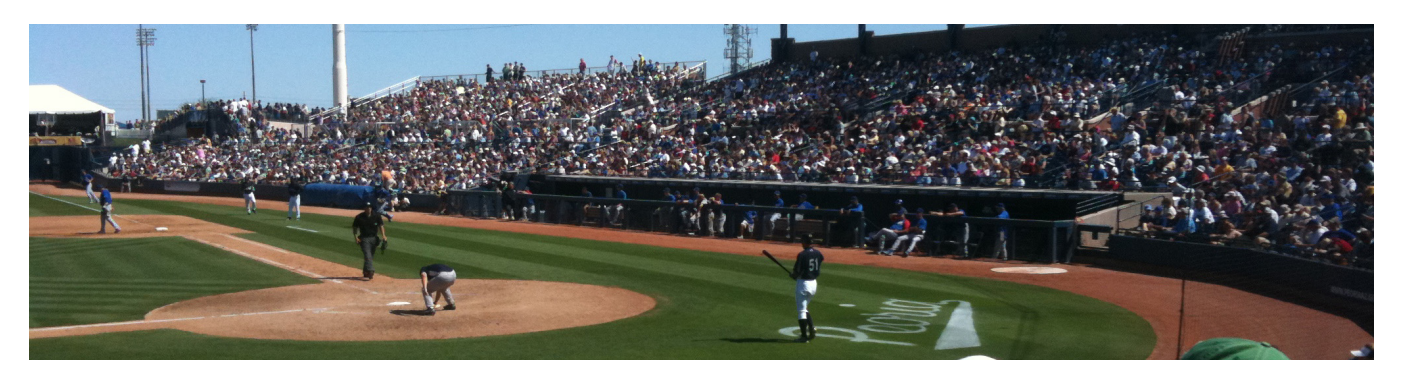
Figure 1. This is a teaser