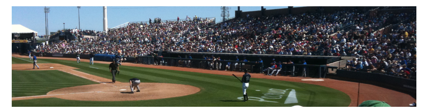
Figure 1. This is a teaser