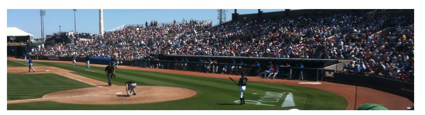
Figure 1: This is a teaser