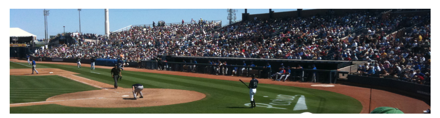
Figure 1. This is a teaser