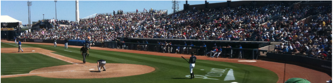
Figure 1. This is a teaser