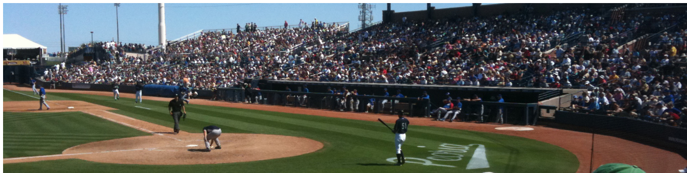
Figure 1. This is a teaser