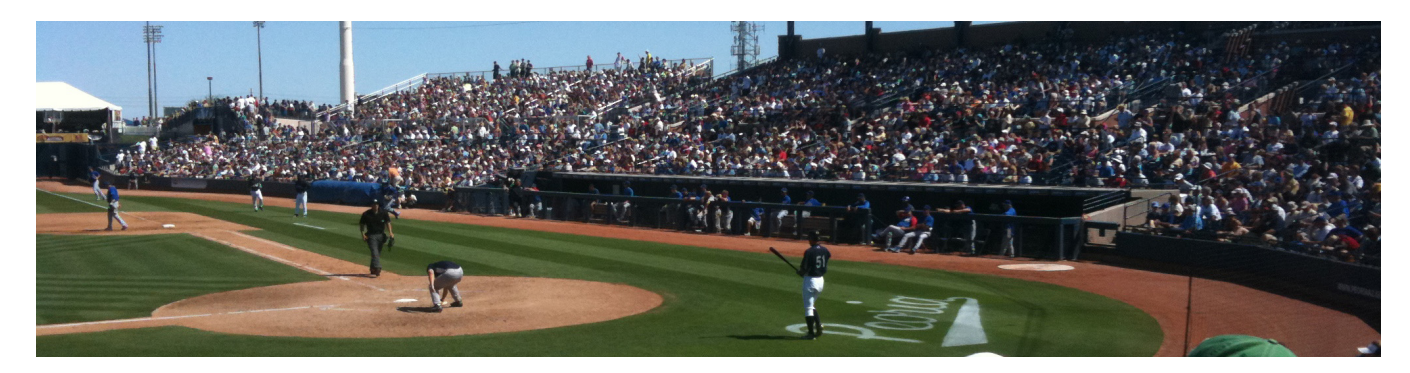
Figure 1. This is a teaser

Anonymous Author(s) Submission Id: 123-A56-BU3