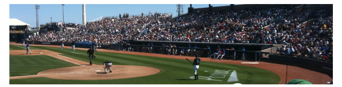
Figure 1. This is a teaser