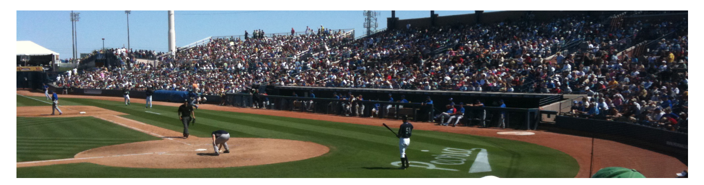
Figure 1. This is a teaser