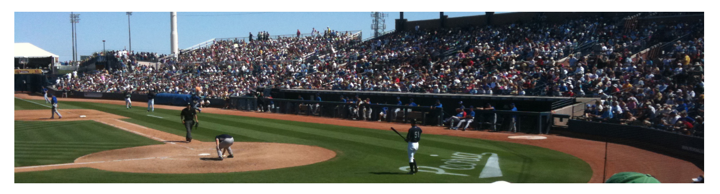
Figure 1: This is a teaser

Julius P. Kumquat The Kumquat Consortium jpkumquat@consortium.net