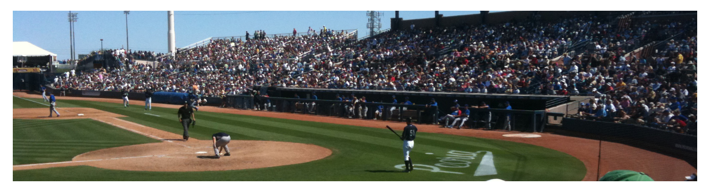
Figure 1: This is a teaser

Julius P. Kumquat The Kumquat Consortium jpkumquat@consortium.net