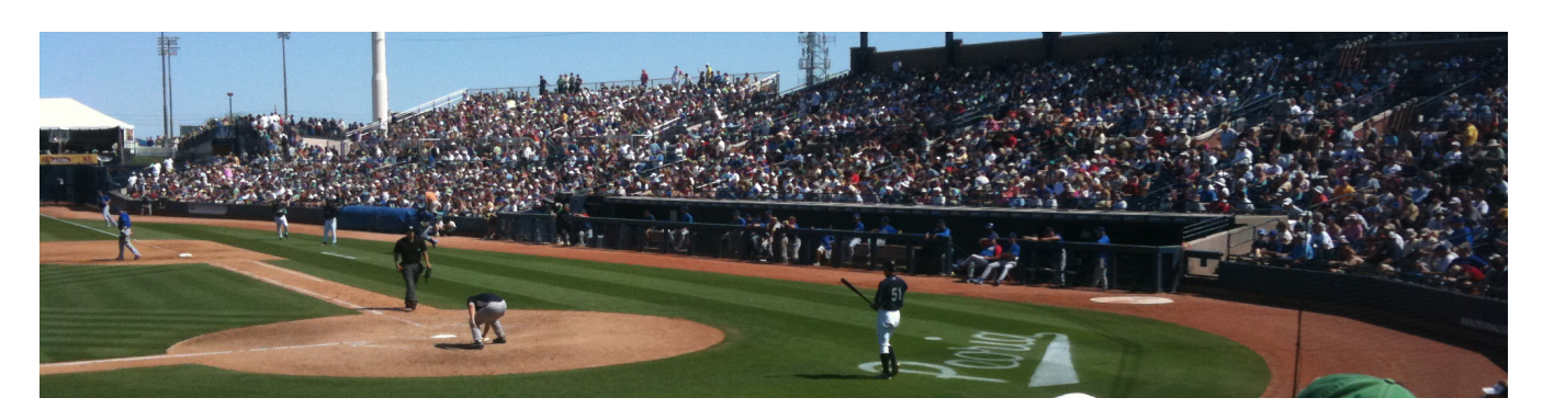
Figure 1: This is a teaser

Julius P. Kumquat The Kumquat Consortium jpkumquat@consortium.net