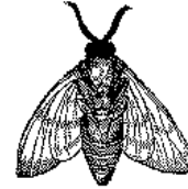
Figure 3: A sample black and white graphic that has been resized with the includegraphics command.

As was the case with tables, you may want a figure that spans two columns. To do this, and still to ensure proper “floating” placement of tables, use the environment figure* to enclose the figure and its caption. And don’t forget to end the environment with figure* , not figure !