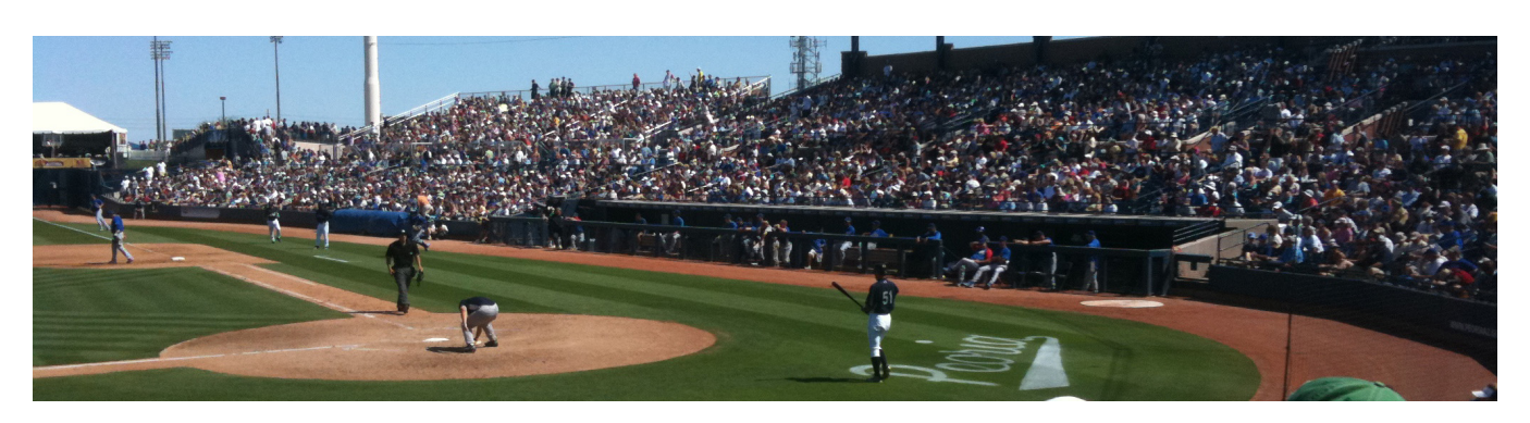
Figure 1: This is a teaser

The Kumquat Consortium jpkumquat@consortium.net