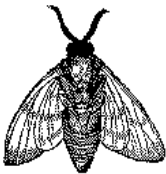
Figure 3: A sample black and white graphic that has been resized with the includegraphics command.

point at which Table 2 is included in the input file; again, it is instructive to compare the placement of the table here with the table in the printed output of this document.