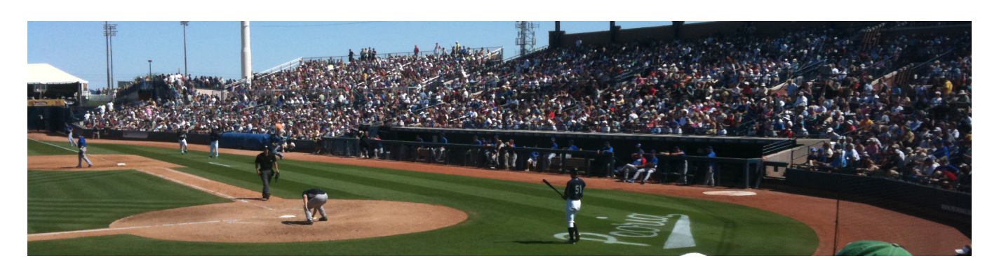
Figure 1: This is a teaser

The Kumquat Consortium jpkumquat@consortium.net