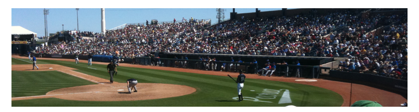
Figure 1: This is a teaser

The Kumquat Consortium jpkumquat@consortium.net