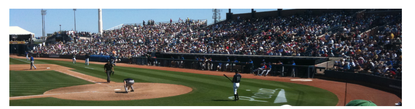
Figure 1: This is a teaser

The Kumquat Consortium jpkumquat@consortium.net