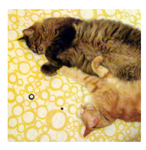
Figure 2: In this image, the cats are tessellated within a square frame. Images should also have captions and be within the boundaries of the sidebar on page 2.