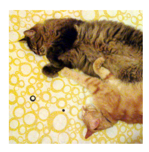
Figure 2: In this image, the cats are tessellated within a square frame. Images should also have captions and be within the boundaries of the sidebar on page 2.