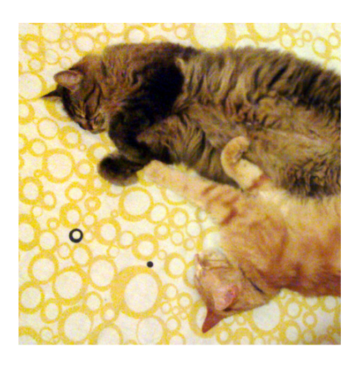
Figure 2: In this image, the cats are tessellated within a square frame. Images should also have captions and be within the boundaries of the sidebar on page 2.