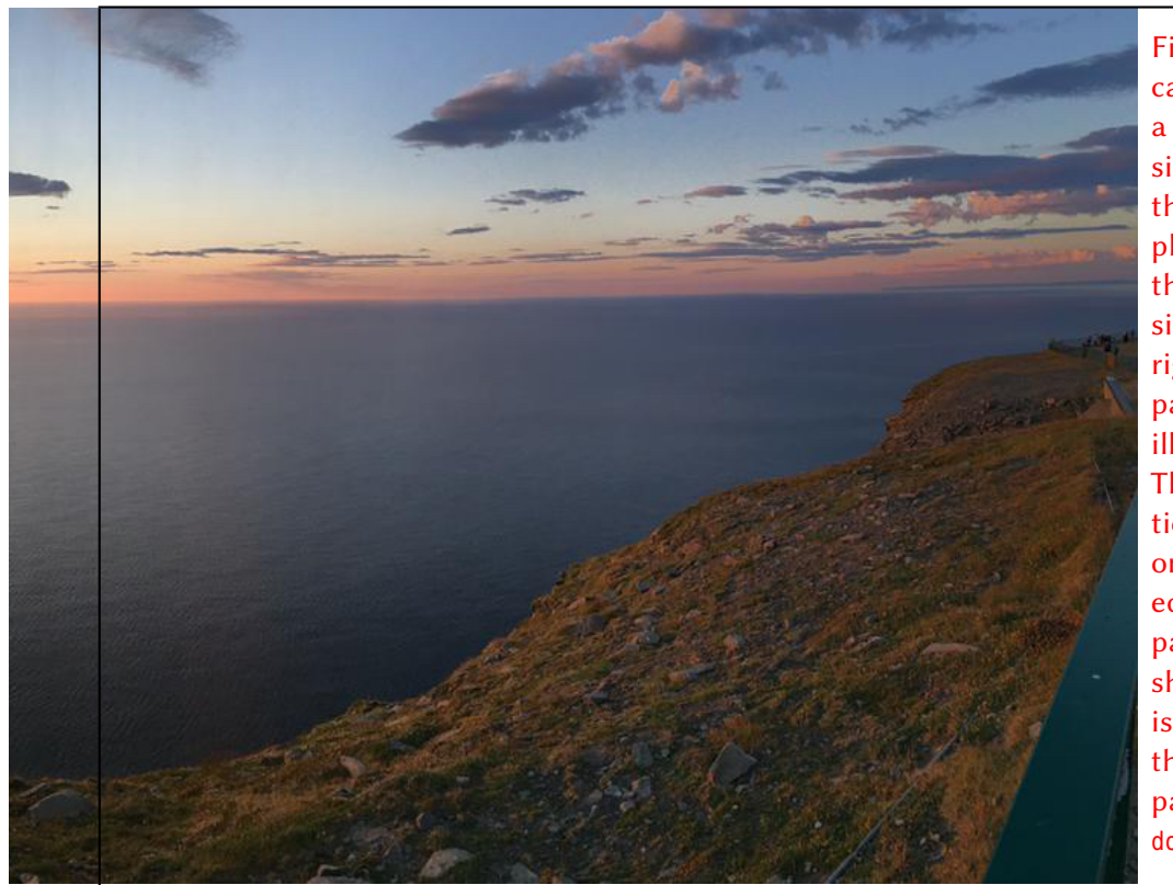
Figure 2: caption for doublesided image that will be placed or the right side of the right-hand part of the illustration. The illustra tion begins on the left edge of the paper. short form is used for the LOF. The parameter is doublePage

a printed text will look like at this place. If you read this text, you will get no information. Really? Is there no information? Is there a difference between this text and some nonsense like "Huardest gefburn"? Kjift – not at all! A blind text like this gives you information about the selected font, how the letters are written and an impression of the look. This text should contain all letters of the alphabet and it should be written in of the original language. There is no need for special content, but the length of words should match the language.