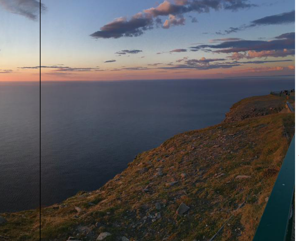
Figure 3: A caption for a double-sided image that will be placed on the right side of the right-hand part of the illustration. The illustration begins on the left edge of the paper A short form is used for the LOF. The parameter is doublePage

This text should show what a printed text will look like at this place. If you read this text, you will get no information. Really? Is there no information? Is there a difference between this text and some nonsense like "Huardest gefburn"? Kjift – not at all! A blind text like this gives you information about the selected font, how the letters are written and an impression of the look. This text should contain all letters of the alphabet and it should be written in of the original language. There is no need for special content, but the length of words should match the language.Hello, here is the second paragraph. Hello, here is some text without a meaning. This text should show what a printed text will look like at this place. If you read this text, you will get no information. Really? Is there no information? Is there a difference between this text and some nonsense like "Huardest gefburn"? Kjift – not at