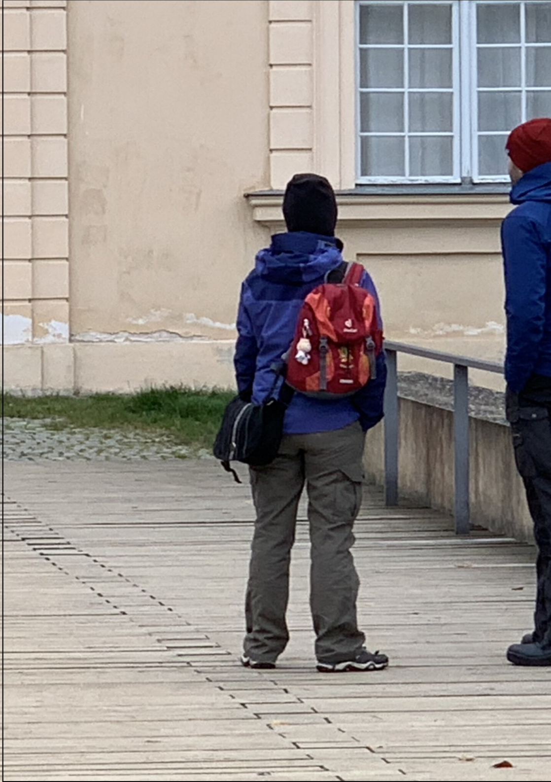
Figure 6: A caption for a double-sided image that will be placed on the right side of the right-hand part of the illustration. The illustration begins on the left edge of the paper. A short form is used for the LOI. The parameter is doubleFULLPAGE