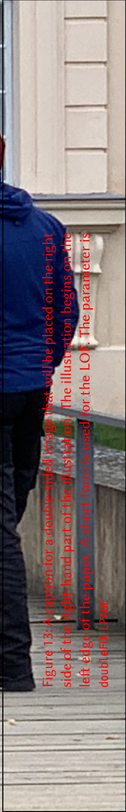
Figure 13: A caption for a double-sided image that will be placed on the right side of the right-hand part of the illustration. The illustration begins on the left edge of the paper. A short form is used for the LOI. The parameter is doubleFULLPAGE