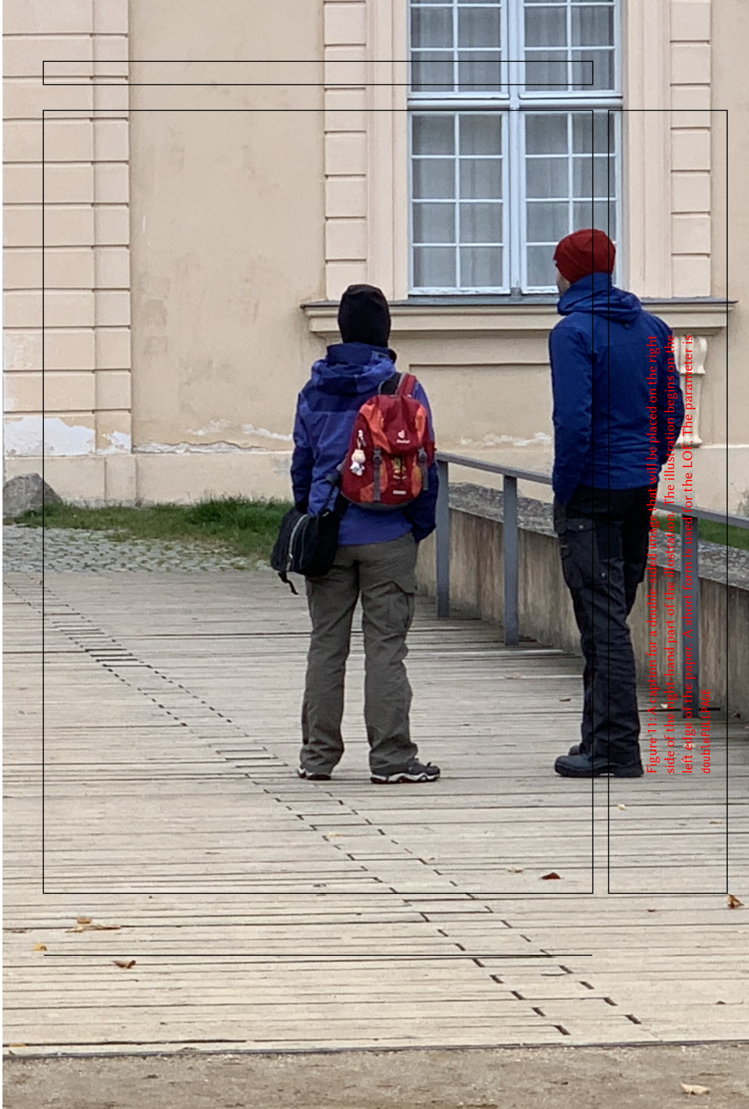
Figure 11: A caption for a double-sided image that will be placed on the right side of the right-hand part of the illustration. The illustration begins on the left edge of the paper. A short form is used for the LOI. The parameter is doubleFULLPAGE