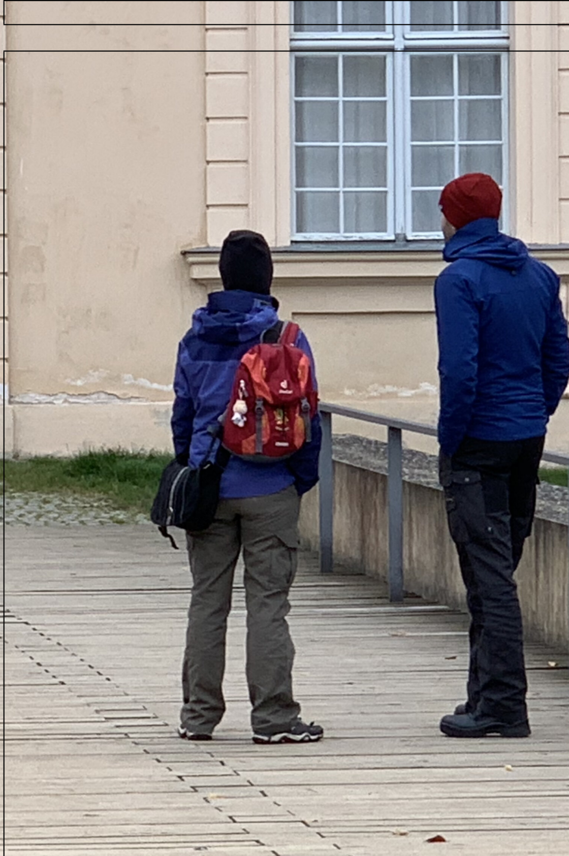
Figure 17: A caption for a double-sided image that will be placed on the right side of the illustration. The illustration begins on the left edge of the paper. A short form is used for the LOF. The parameter is doubleFULLPAGE