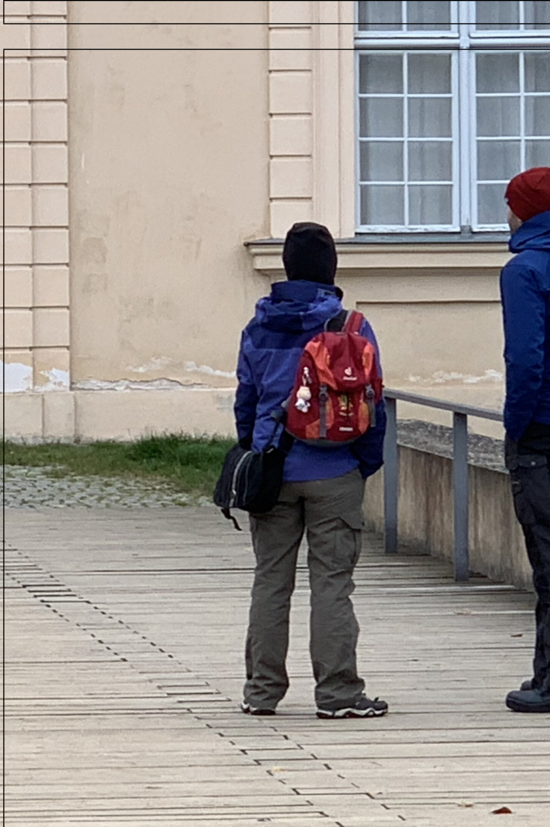
Figure 14: A caption for a double-sided image that will be placed on the right side of the right-hand part of the illustration. The illustration begins on the left edge of the paper. A short form is used for the LOF. The parameter is doubleFULLPAGE