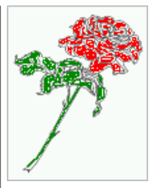
Figure 2: A default caption of a "default" object with the default setting, which is a "left" caption which means that it always appears before the object.