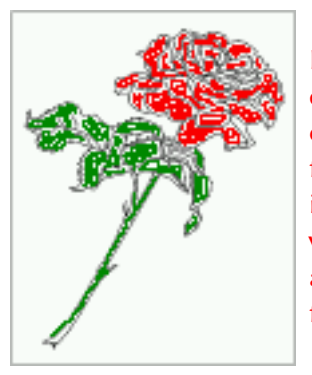
Figure 2: A default caption of a "default" object with the default setting, which is a "left" caption which means that it always appears before the object.

First item in a list First item in a list First item in a list Second item in a list Second item in a list Second item in a list