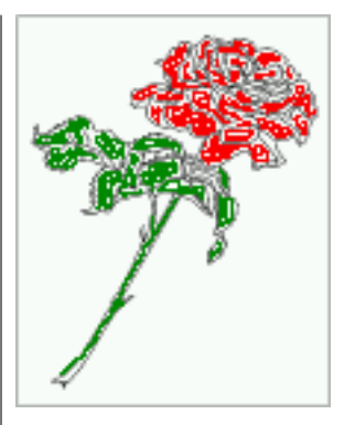
Figure 2: A default caption of a "default" object with the default setting, which is a "left" caption which means that it always appears before the object.