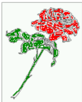
Figure 12: Here comes a caption to show the justification of the text relative to the object. It refers to the optional argument capPos.

\hvfloot[capPos=outer]{figure}{\includegraphics{frose}}{\capLongText}{}