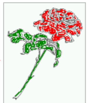
Figure 24: Here comes a caption to show the justification of the text relative to the object. It refers to the optional argument capPos.

\hvFloat[capPos=outer]{figure}{\includegraphics{ frose}}{\capLongText}{}