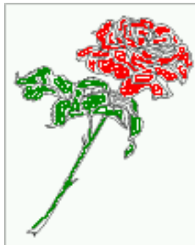
Figure 2: Here comes a caption to show the justification of the text relative to the object. It refers to the optional argument capPos .

\hvFloat{figure}{\includegraphics{frose}}{\capLongText}{}