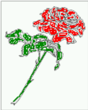
Figure 7: A short caption

\hvFloat[capPos=after]{figure}{\includegraphics{frose}}{\capShortText}{}