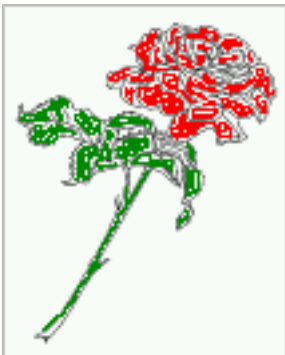
Figure 8: Here comes a caption to show the justification of the text relative to the object. It refers to the optional argument capPos.

\hvFloat[capPos=after]{figure}{\includegraphics{frose}}{\capLongText}{}