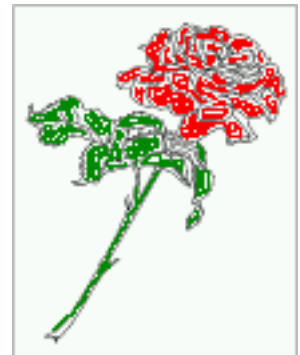
Figure 6: Here comes a caption to show the justification of the text relative to the object. It refers to the optional argument capPos .

T E X is a typesetting language. Instead of visually formatting your text, you enter y our manuscript text intertwined with T E X commands in a plain text file. You then run T E X to produce formatted output, such as a PDF file.