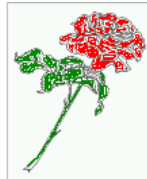
Figure 15: A short caption

Hello, here is some text without a meaning. This text should show what a printed text will look like at this place. If you read this text, you will get no information. Really? Is there no information? Is there a difference between this text and some nonsense like “Huardest gefburn”? Kjift – not at all! A blind text like this gives you information about the selected font, how the letters are written and an impression of the look. This text should contain all letters of the alphabet and it should be written in of the original language. There is no need for special content, but the length of words should match the language.