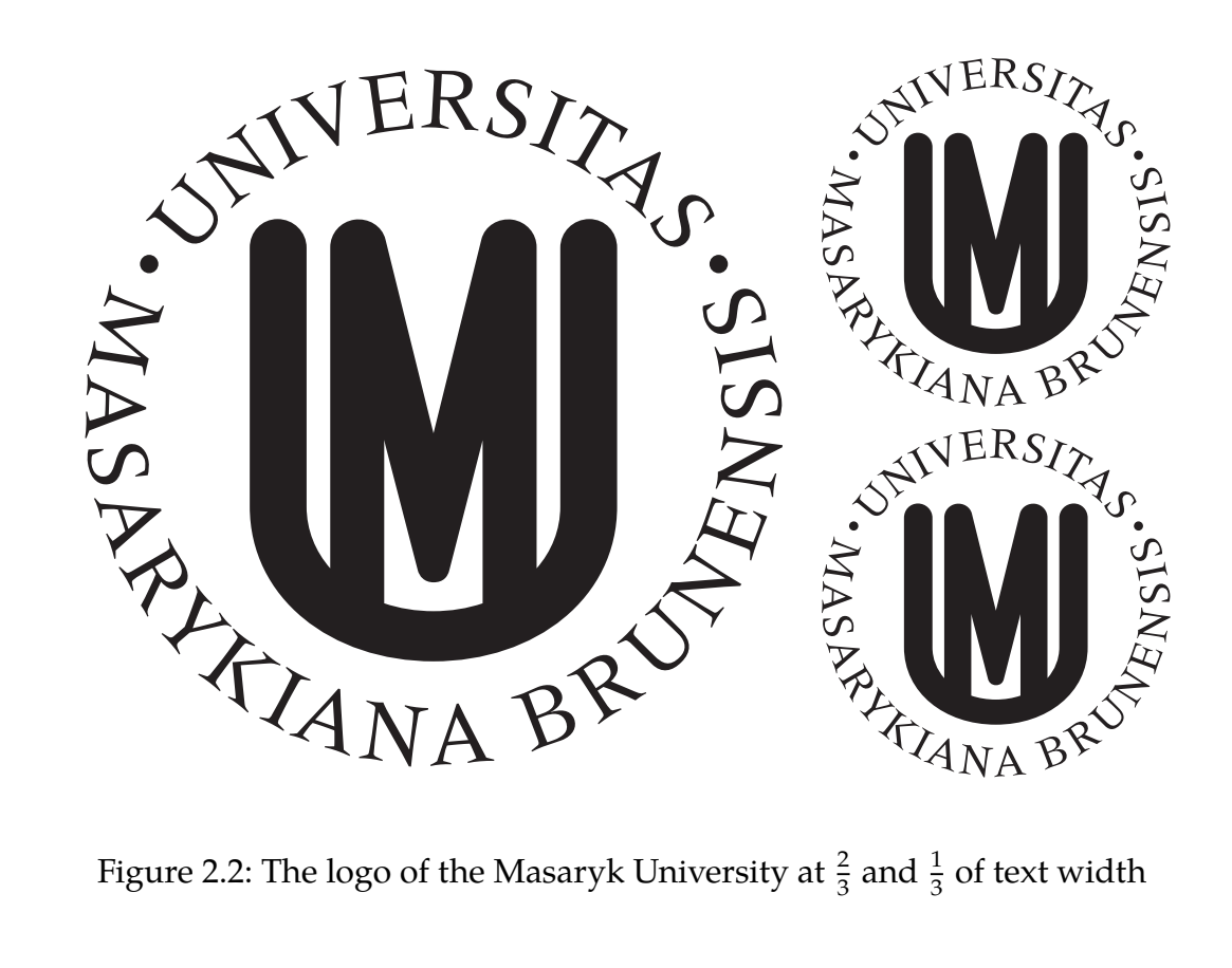
Figure 2.2: The logo of the Masaryk University at \frac{2}{3} and \frac{1}{3} of text width