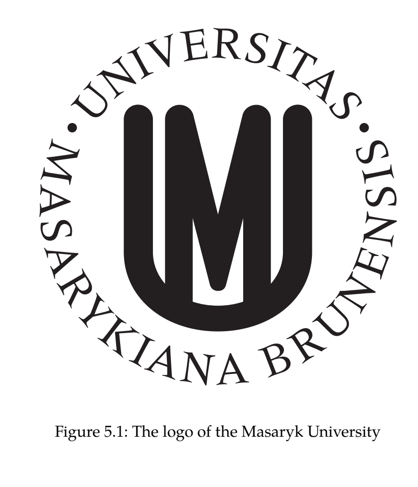
Figure 5.1: The logo of the Masaryk University