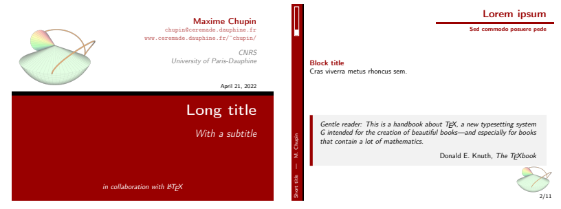
Examples using the rule option.

rule: that add a rule between the color areas in the different slides: title (see p. section 4), section and part (see p. 14), sepframe frame(see p. 20), thanks frame (see p. 21), as well as classical slides, between the left bar (sidebar or not) and the text area.