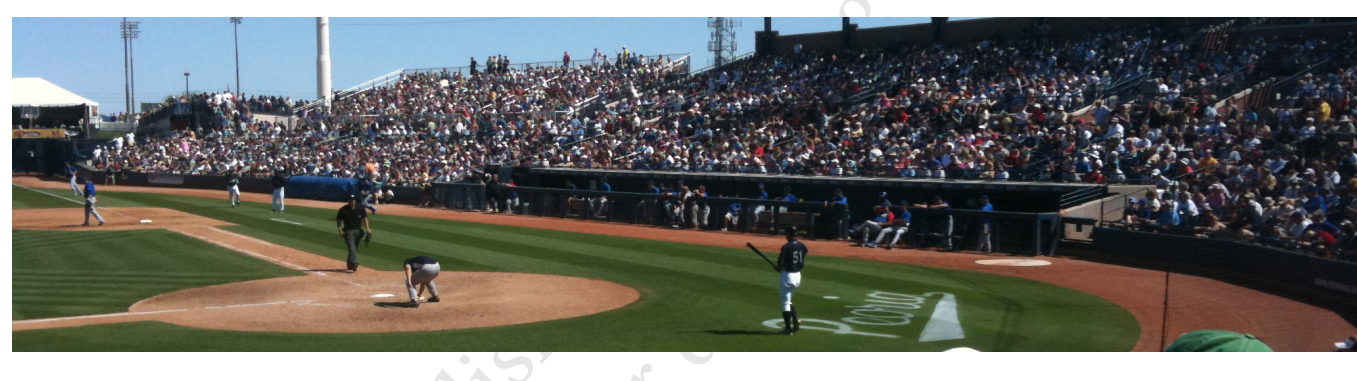
Figure 1: Seattle Mariners at Spring Training, 2010.

Julius P. Kumquat The Kumquat Consortium jpkumquat@consortium.net