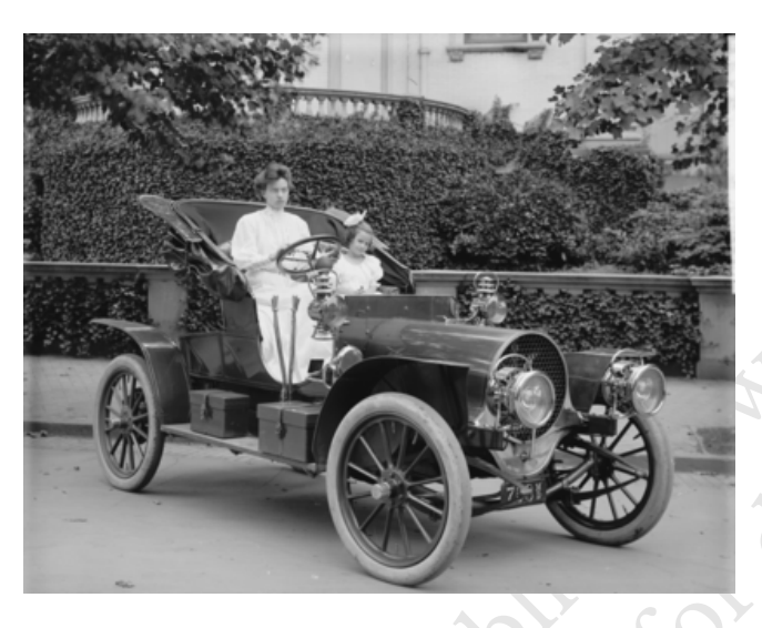
Figure 2: 1907 Franklin Model D roadster.

The "figure" environment should be used for figures. One or more images can be placed within a figure. If your figure contains thirdparty material, you must clearly identify it as such, as shown in the example below.