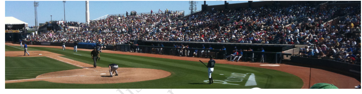
Figure 1: Seattle Mariners at Spring Training, 2010.

Julius P. Kumquat The Kumquat Consortium New York, USA jpkumquat@consortium.net