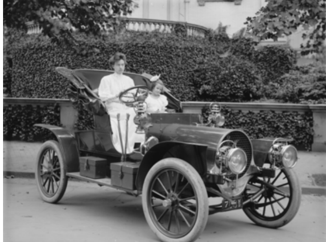
Figure 2: 1907 Franklin Model D roadster.